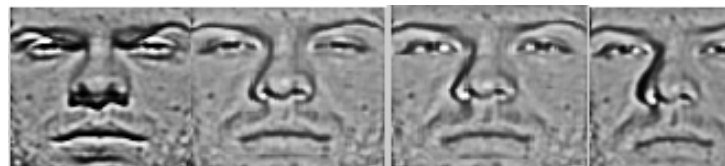
Figure 1f: Weber Faces