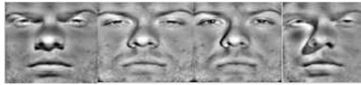
Figure 1b: Results of DCT Normalization