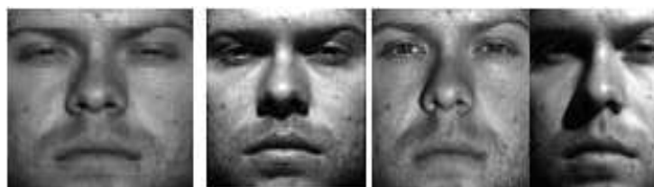
Figure 1a: Images under Different Illumination from Extended Yale B Database

These images are normalized using the techniques namely DCT normalization, Wavelet Denoising, Gradient Faces, Local Contrast Enhancement and Weber Faces. Figure 1 shows the images after illumination normalization by different methods.