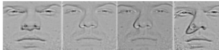
Figure 1e: Results of Local Contrast Enhancement