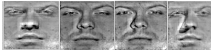
Figure 1c: Results of Wavelet Denoising