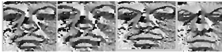
Figure 1d: Gradient Faces